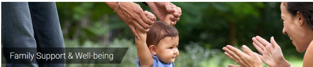
Family Support & Well-being

More than 1 million children ages birth to 6 experience homelessness in the U.S. These children are automatically eligible for Head Start and Early Head Start programs. Homelessness is a circumstance families may experience when they are faced with such challenges as extreme poverty and lack of affordable housing. It can also occur when a family's current living situation becomes unsafe or unstable.