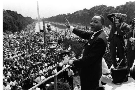
THE REV. DR. MARTIN LUTHER KING JR. AT THE MARCH ON WASHINGTON IN 1963.

Observed each year on the third Monday in January as “a day on, not a day off,” MLK Day is the only federal holiday designated as a national day of service to encourage all Americans to volunteer to improve their communities. AmeriCorps has been charged with leading this effort for the past quarter century.